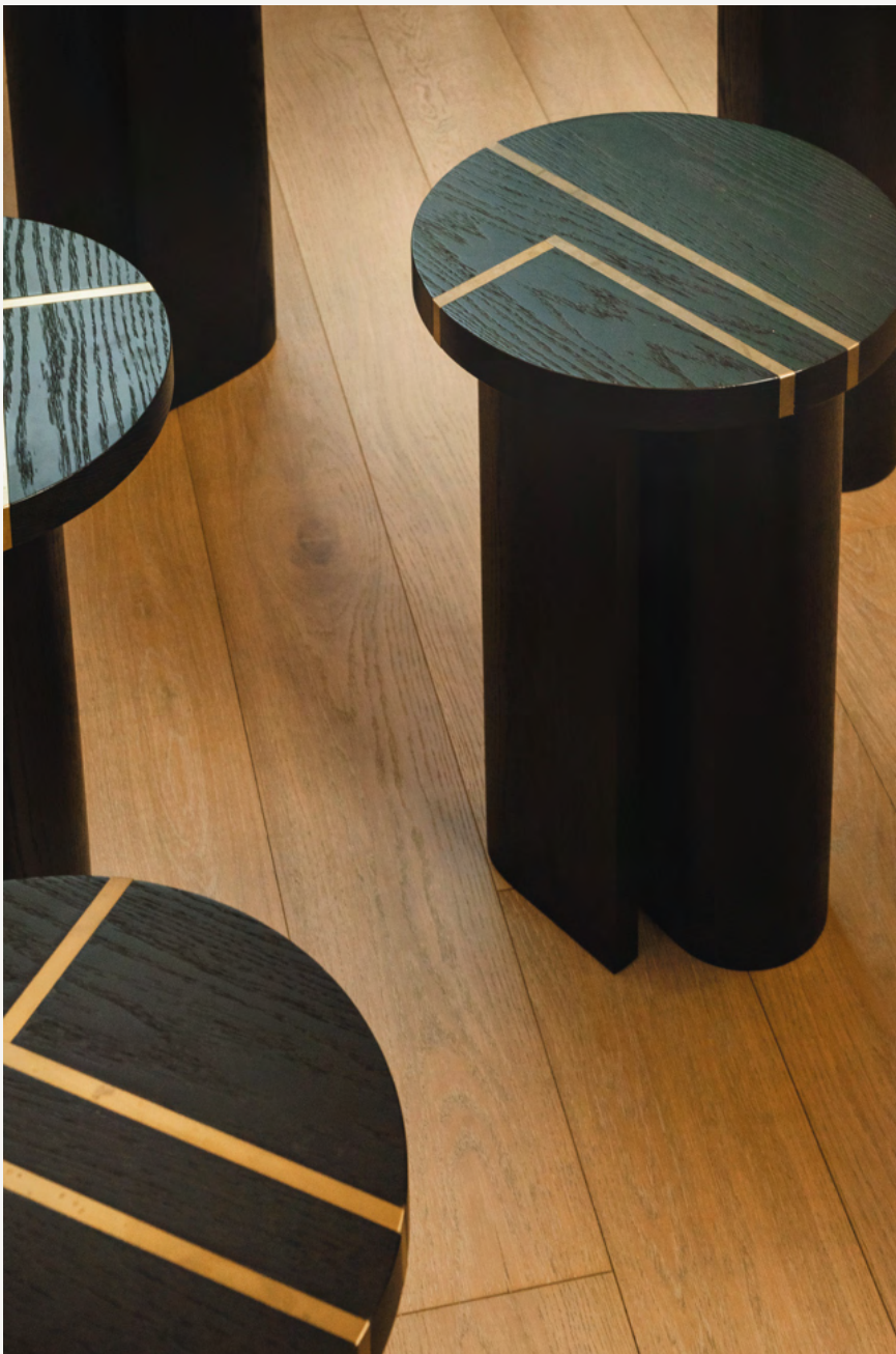
curve side tables with brass inlay