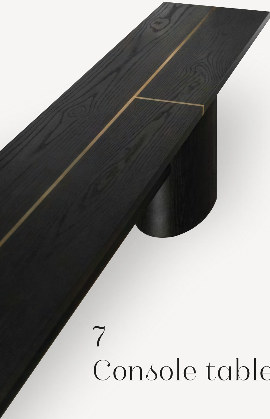
7 Console table